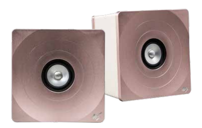
< Brush Stipple Rose Alloy >