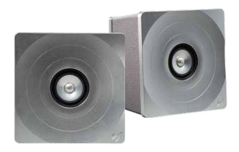
< Brush Stipple Grey Alloy >